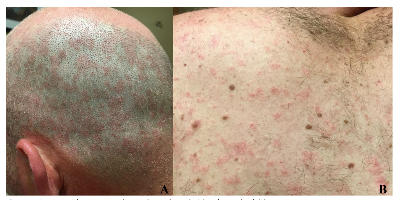
Figure 1. Guttate erythematous, scaly macules on the scalp (A) and upper back (B).

A shave biopsy was performed from a lower back lesion. Biopsy demonstrated regular psoriasiform epidermal hyperplasia, loss of the granular layer, and parakeratosis with neutrophils. There was a sparse perivascular lymphoid infiltrate surrounding dilated